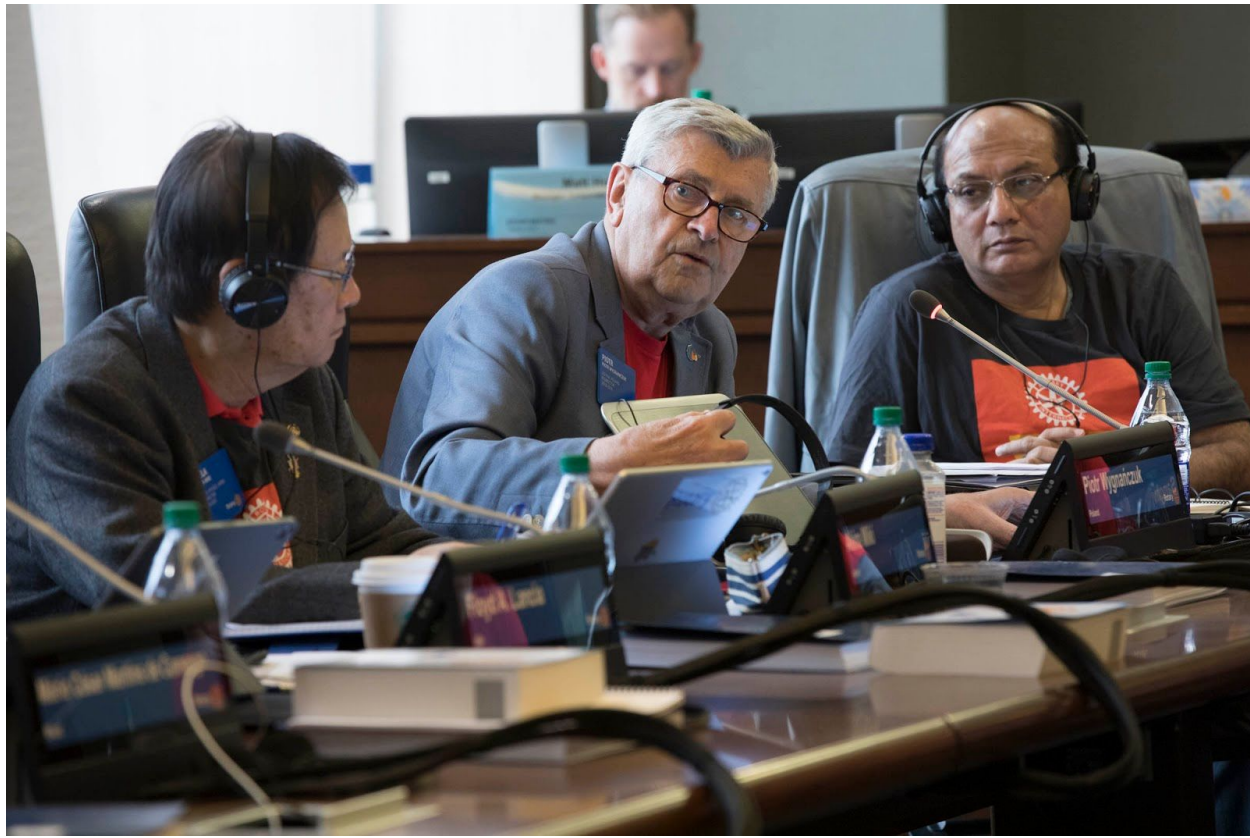
Board of Rotary International