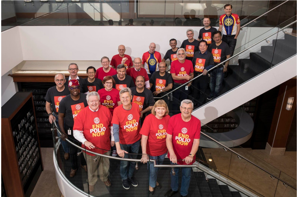
World Polio Day 2019

· agreed to add Gavi The Vaccine Alliance as a partner to the Global Polio Eradication Initiative;